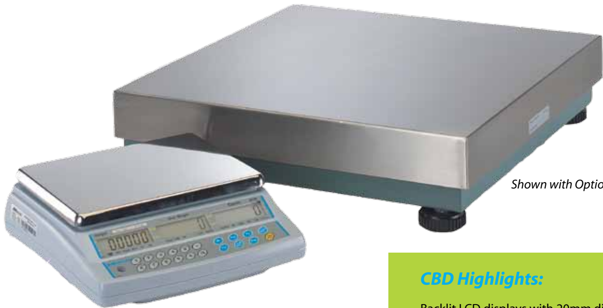
Shown with Optional Base

The CBD offers powerful counting processing in a simple to use and set up scale.